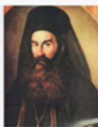
ΠΑΛΑΙΟΝ ΠΑΤΡΩΝ ΓΕΡΜΑΝΟΣ